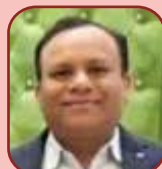
NANHA RAM Dy. Excise Commissioner