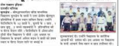
गीता बॉयज स्कूल के छात्रों ने उत्तर क्षेत्रीय खेलकूद प्रतियोगिता में लहराया परचम

कलकत्ता राष्ट्रीय प्रतियोगिता में प्रवेशपत्रों में चयन होना और तीन छात्र प्रथम स्थान पर चयन