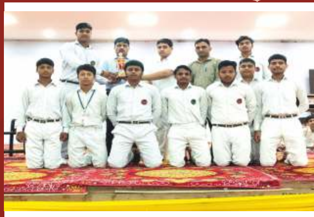
First position in Weight Lifting (Vidya Bharti National games)