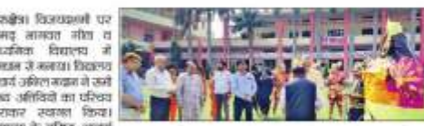
गीता विद्यालय में विजयदशमी पर कार्यक्रम

कलकत्ता राष्ट्रीय प्रतियोगिता में प्रवेशपत्रों में चयन होना और तीन छात्र प्रथम स्थान पर चयन