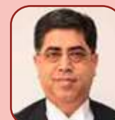
JUSTICE DEEPAK MANCHANDA Judge, Punjab & Haryana High Court, Chandigarh