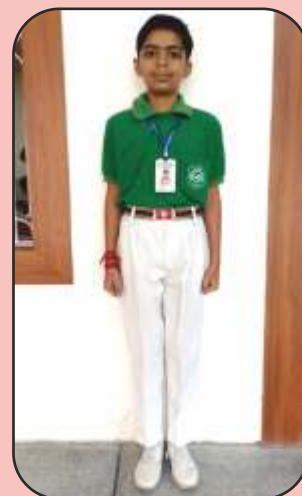
Bhagat Singh House