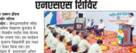
गीता विद्यालय में लगा एक दिवसीय एनएसएस शिविर

कलकत्ता राष्ट्रीय प्रतियोगिता में प्रवेशपत्रों में चयन होना और तीन छात्र प्रथम स्थान पर चयन