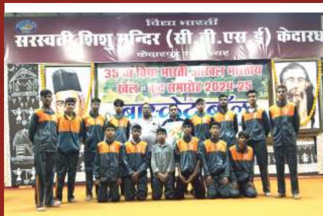
Third position in Basketball (Vidya Bharti National games)