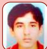
SODAGAR Topper in Distt.