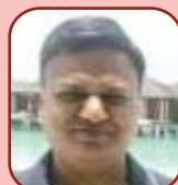
ASHOK MITTAL, IRS Ex. Income Tax Commissioner