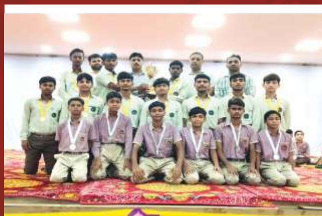
Second position in Football (Vidya Bharti National games)